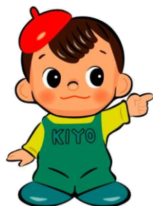
The Kiyo Bank official character KiyoBouya®